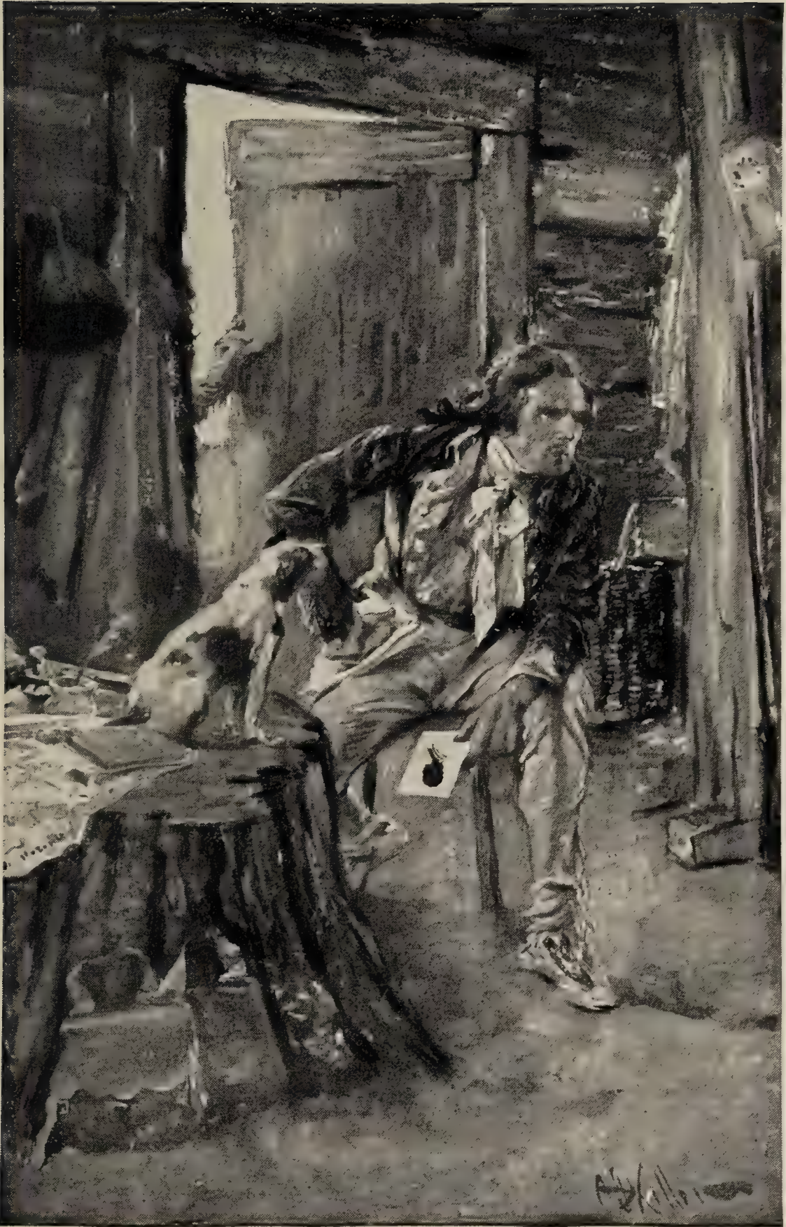
“Her face indeed!”